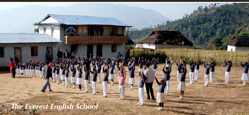
The Everest English School

In August of 2009 the Canadian World Education Society (CanWES) proudly celebrated its third year of existence. It now successfully owns and operates the Everest English School (EES), located in the remote village of Sanitar, Nepal. Currently at EES there are 160 students in attendance and 12 paid staff members.